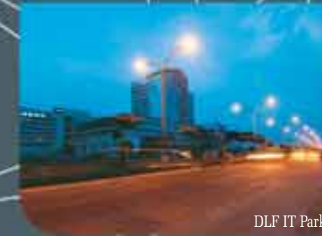
DLF IT Park