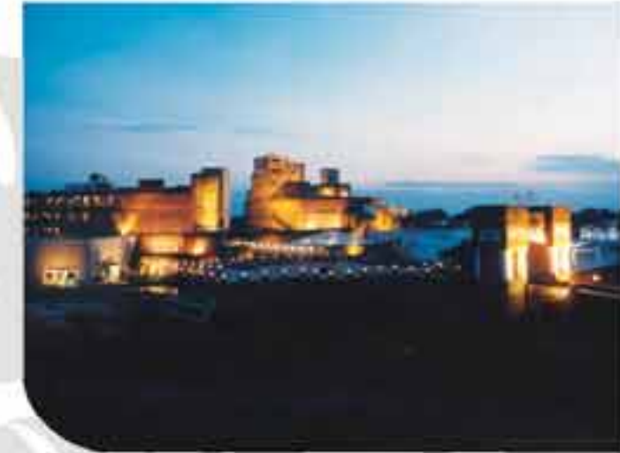
Ffort Radisson in Raichak