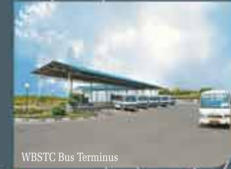
WBSTC Bus Terminus