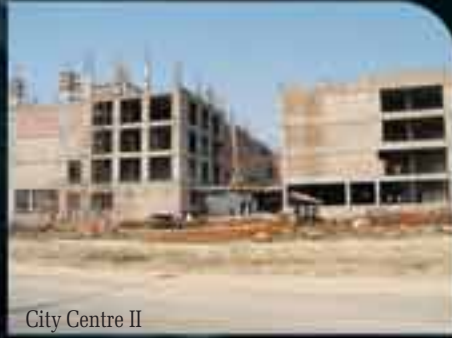
City Centre II