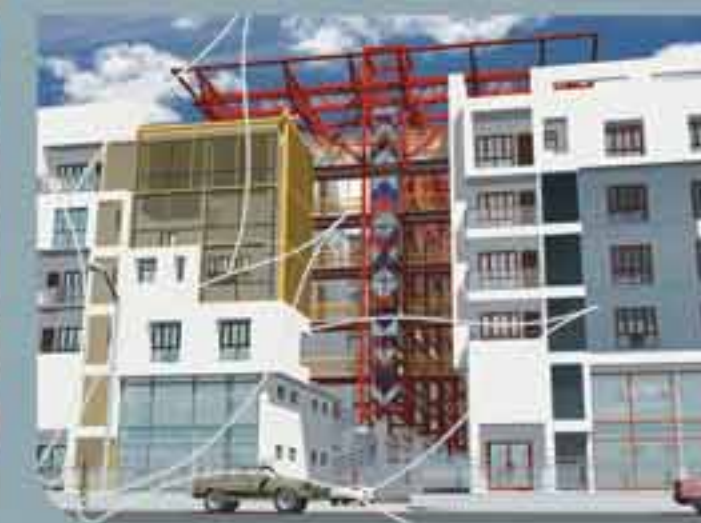
Fort Lee I

Fort Group is the most admired real estate brand in Eastern India. Fort Group's portfolio defines the skylines of Kolkata with landmarks like Fort Knox, Oasis, Fort Tara, Fort Purabi and more. For more than a decade, it has been synonymous with 'good, robust and affordable lifestyle'. Rest assured, your investment and your dreams are in hands that sincerely care for you.