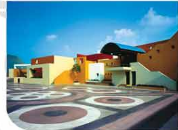
Rang Durbar in Swabhumi