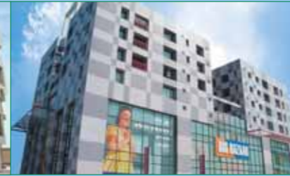
Fort Lee II