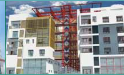
Fort Lee I